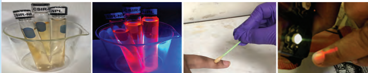
Invisible luminescent election ink under normal light and UV light for Finger Marker to deter double voting (Figure 1)

Voters of CSIR society members highly appreciated the feedback on this ink, and all were highly excited about this ink.