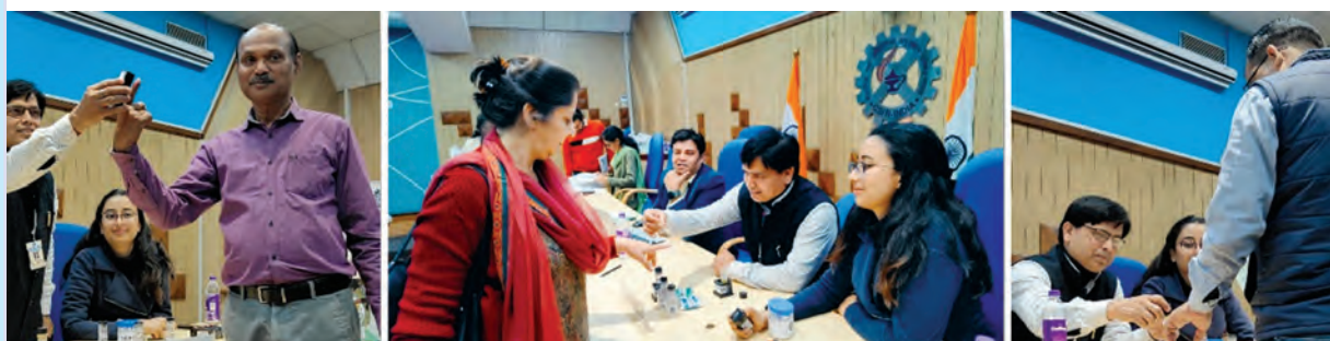
Some glimpses of voters while voting in CSIR Cooperative Society Election