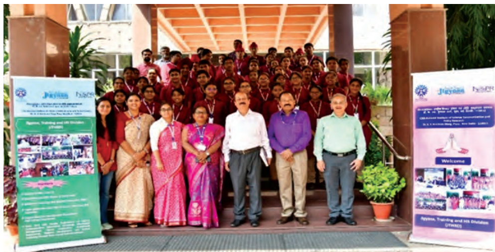
A glimpse of the Programme

CSIR-NIScPR hosted a Student-Scientist Connect Programme at its SV Marg Campus on 30 October 2023. The programme aimed to nurture and instil a scientific temperament among the students while actively promoting science education. A total of 45 students, accompanied by 2 teachers from “The Indian School” in Sadiq Nagar, New Delhi, attended the event.